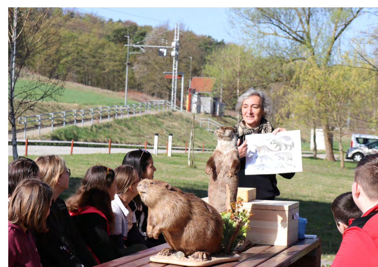
Beaver workshops for children are held in their local environment.