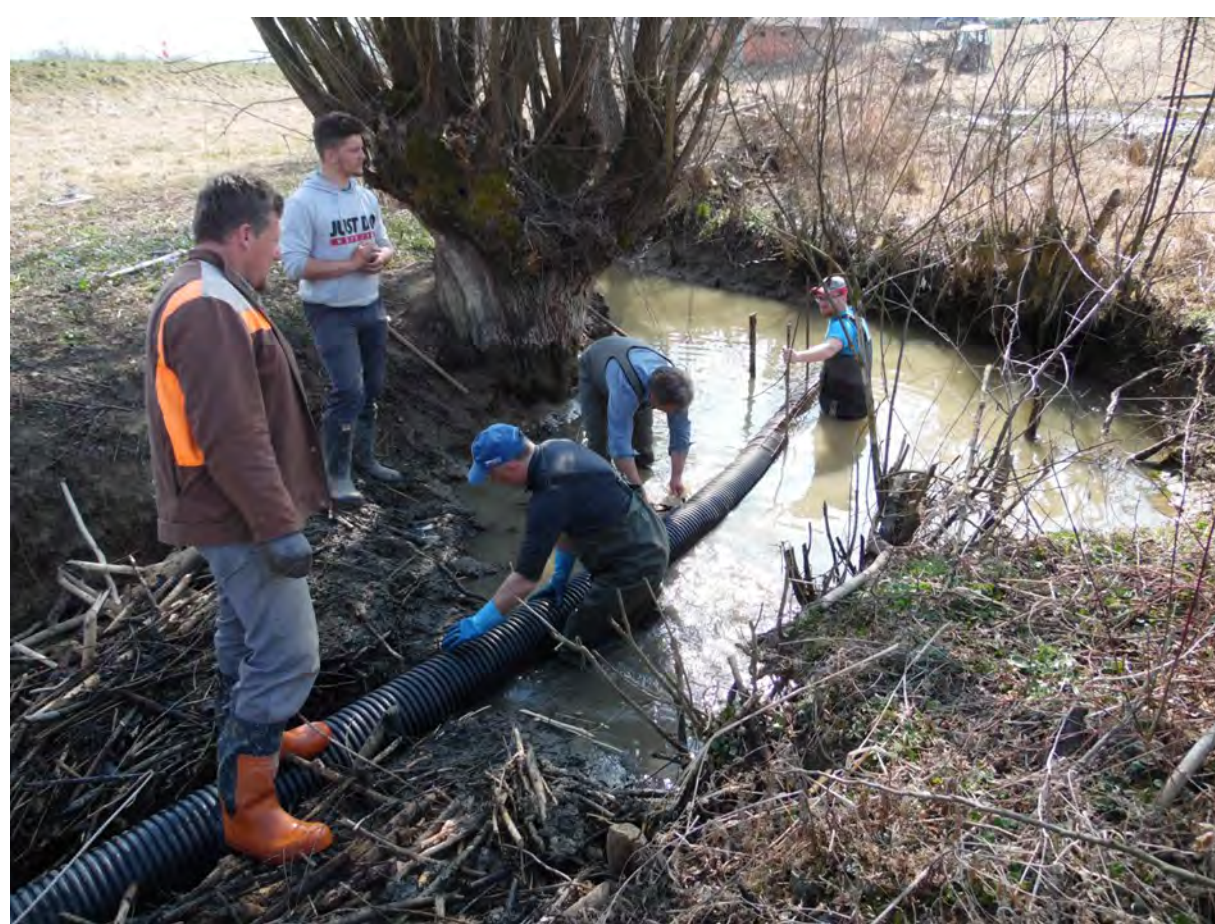
Beaver deceiver "BOBROBRAN" installation on a smaller stream.