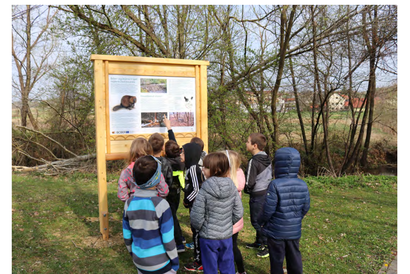
Informational boards in beaver's habitat with basic facts about the species.