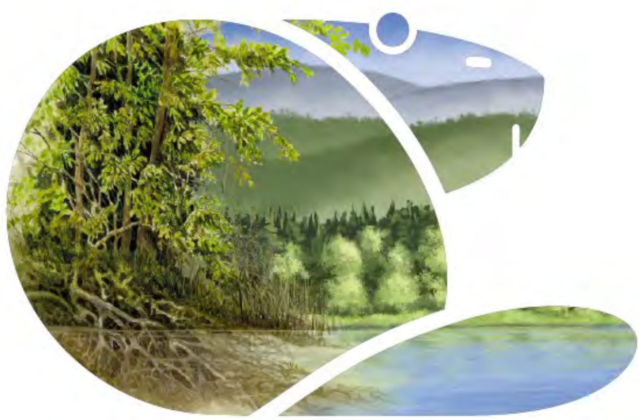
Beaver is promoted as a key species of fresh water habitats.

Ecosystem services provided by wetlands need to be reconsidered and assessed also in terms of economic values . Results will be used as an important tool in the process of accepting policies and decision making related to water, forests, agriculture, climate change and biodiversity at local, national and even EU level.