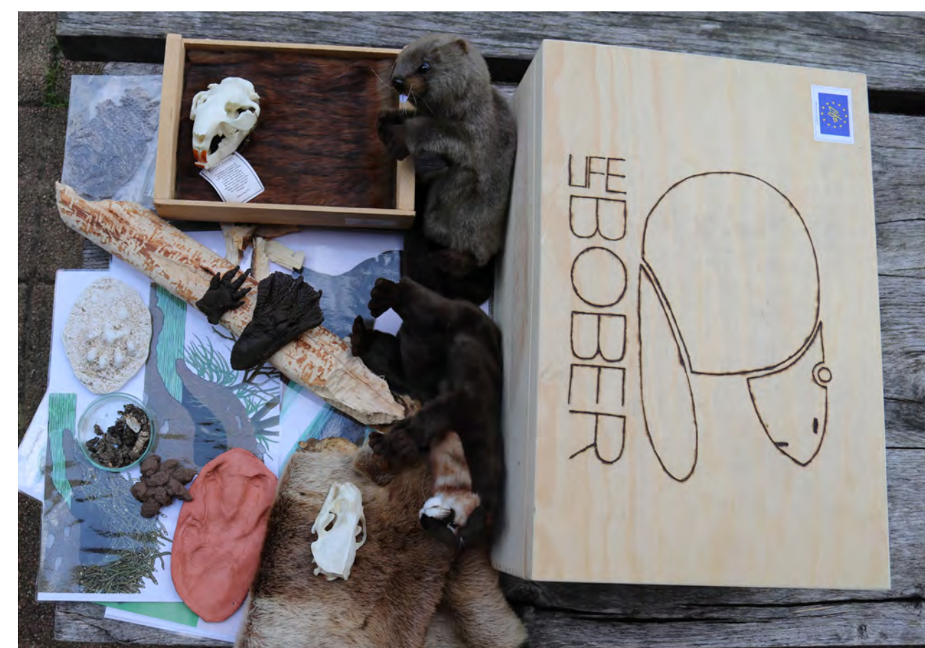
Educational toolbox for schools enables learning with the use of all senses.