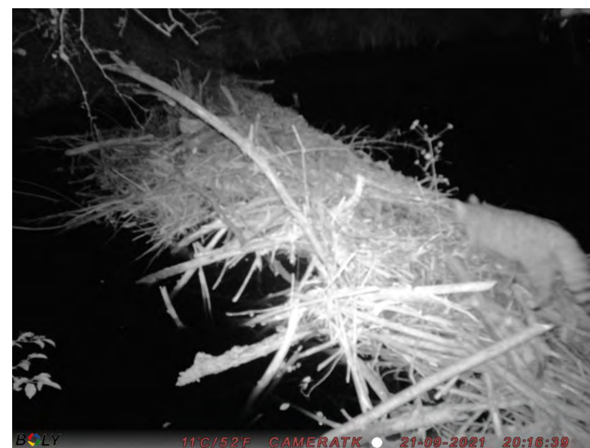
Wildcat ( Felis silvestris ) - monitoring of mitigation measures proves the use of beaver dams by many species.