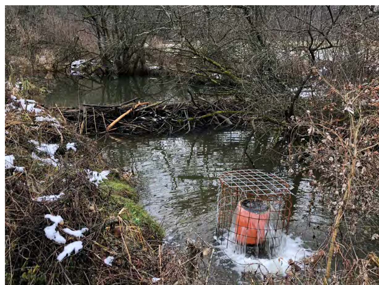
Mitigation measure "BOBROBRAN" protecting farmland of 14 different landowners.